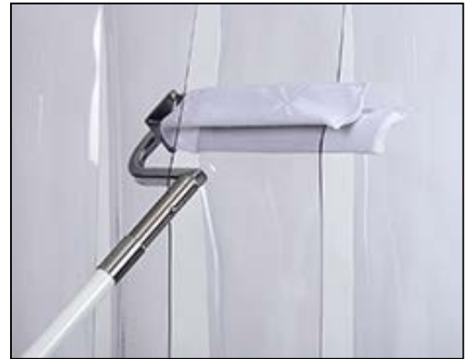
DualClean Softwall Strip Cleaner and curtain strip path