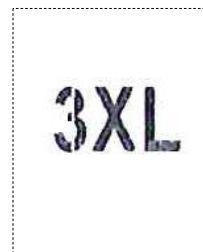
Size label bag