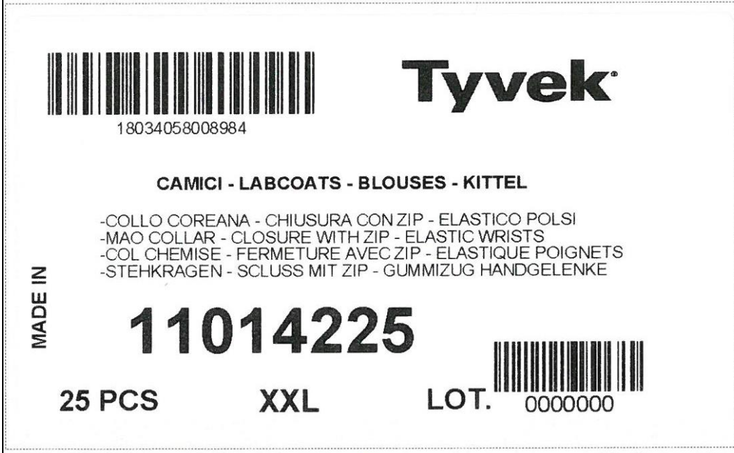
Carton box label