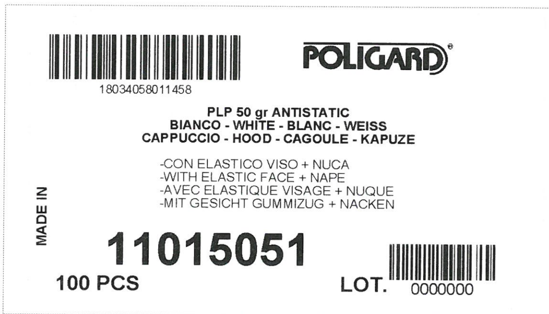
Etichetta per cartone