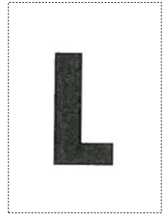
Size label bag