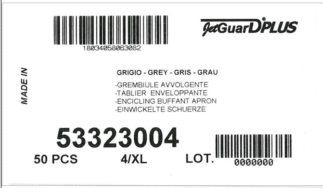
Garment size label