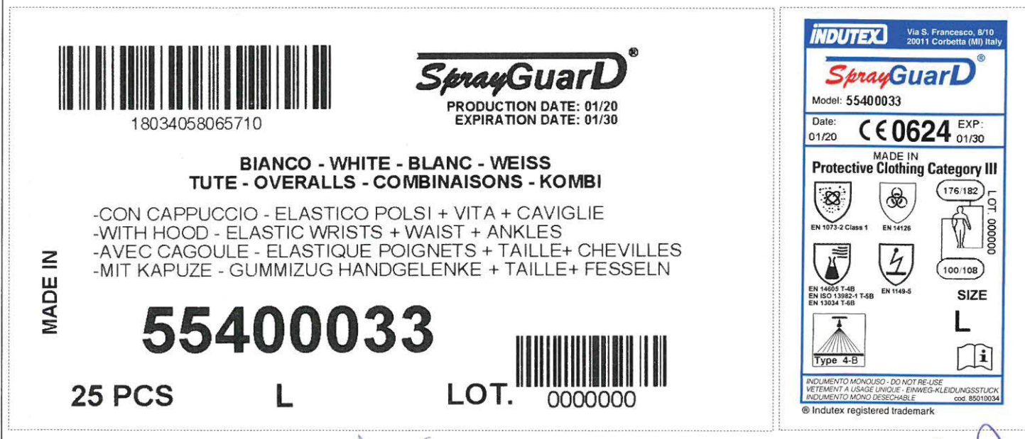
Etichetta taglia per indumento