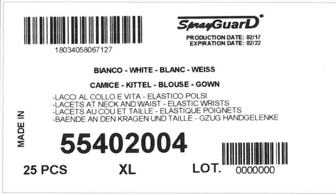
Etichetta taglia per indumento