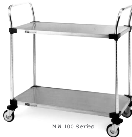
MW 100 Series