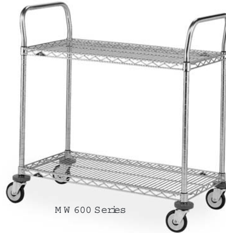
MW 600 Series

If any part of any cart is damaged by use, replacement parts are readily available and easily installed.